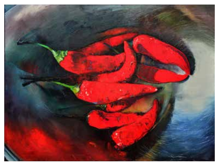
Seven Spanish Chillies in a bowl out in the sun oil on canvas