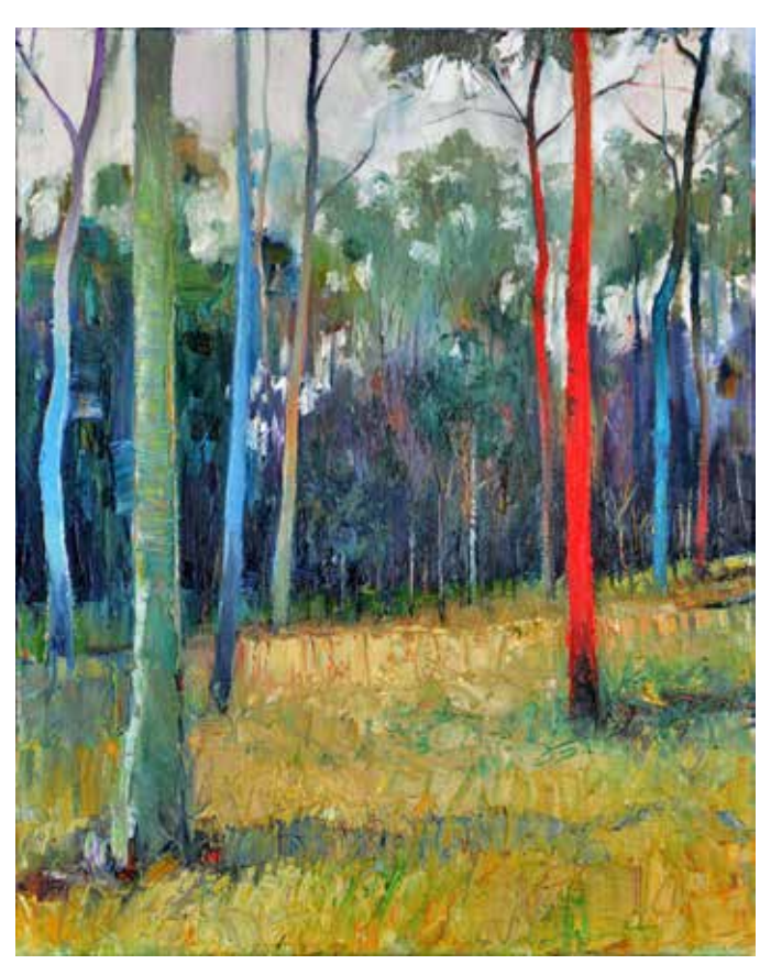
Bush Walk oil on canvas