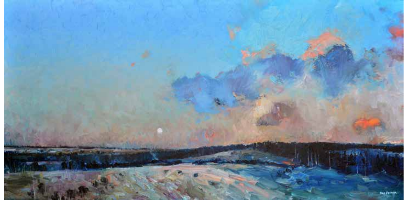
The Passing oil on canvas Cover image: Up River oil on canvas