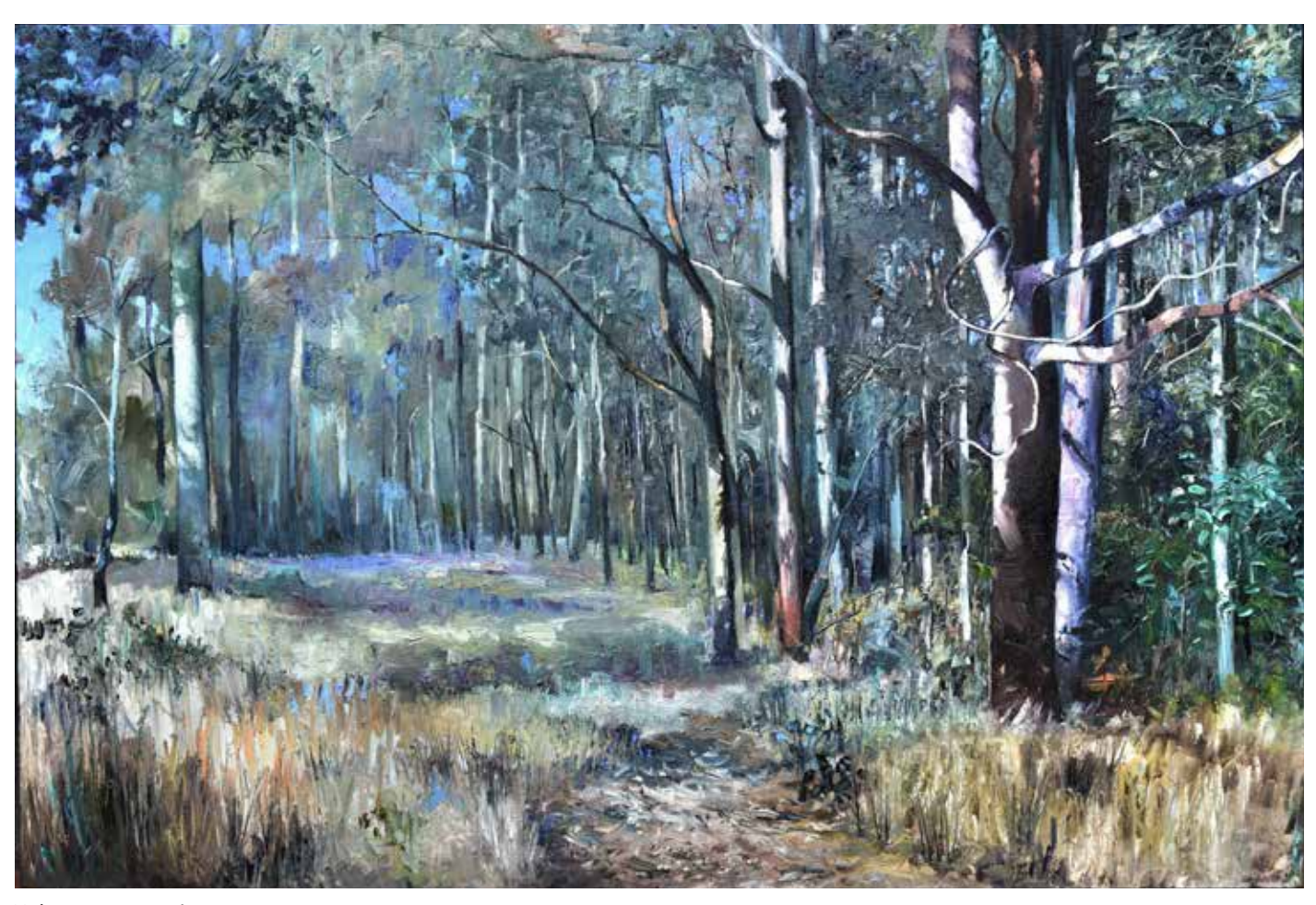
Mahogany Haze oil on canvas