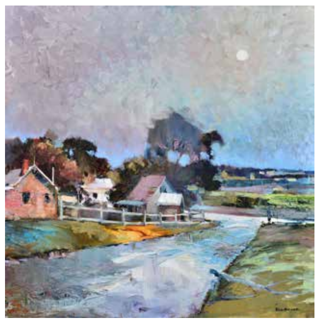
One night in a country town oil on canvas