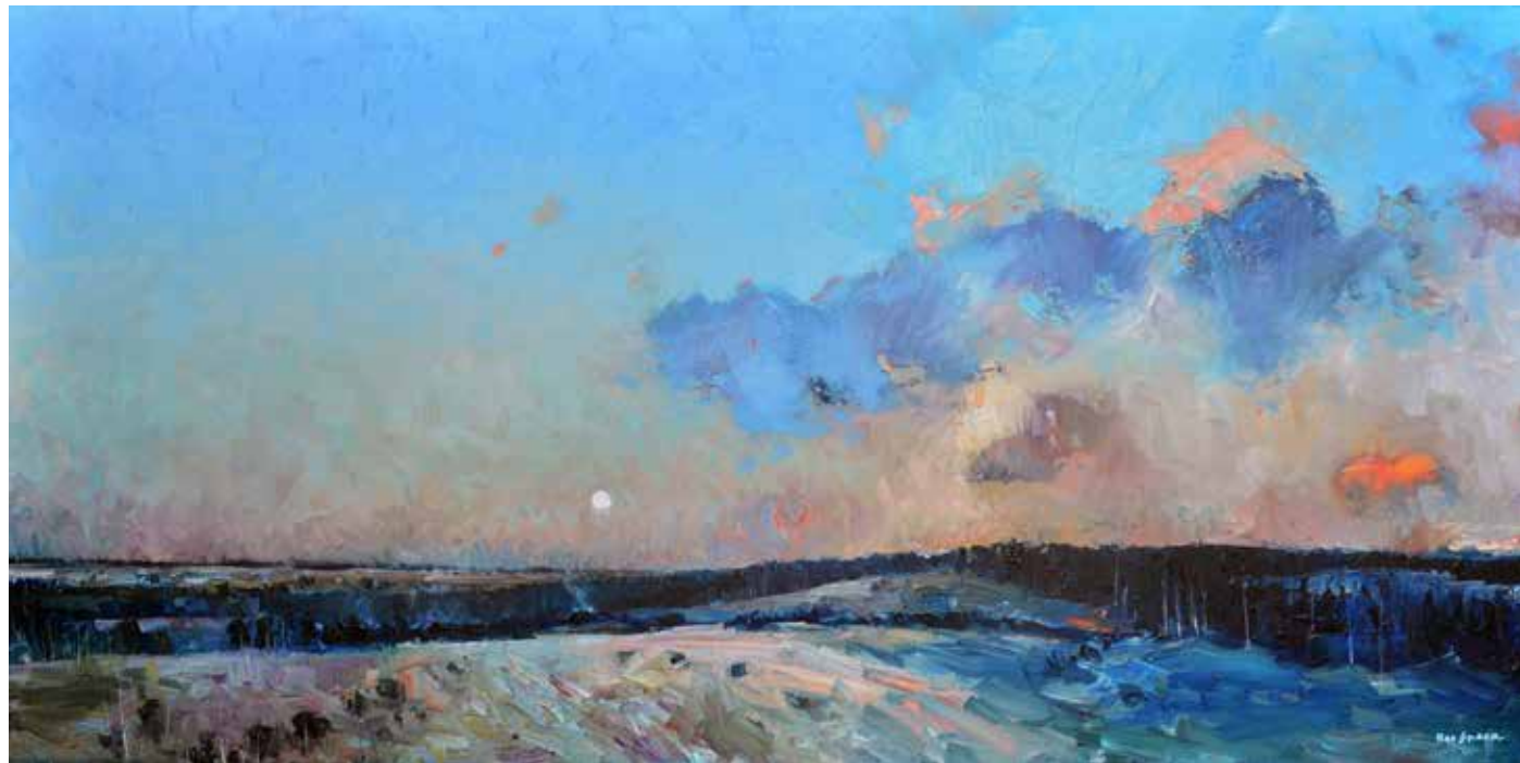
The Passing oil on canvas Cover image: Up River oil on canvas