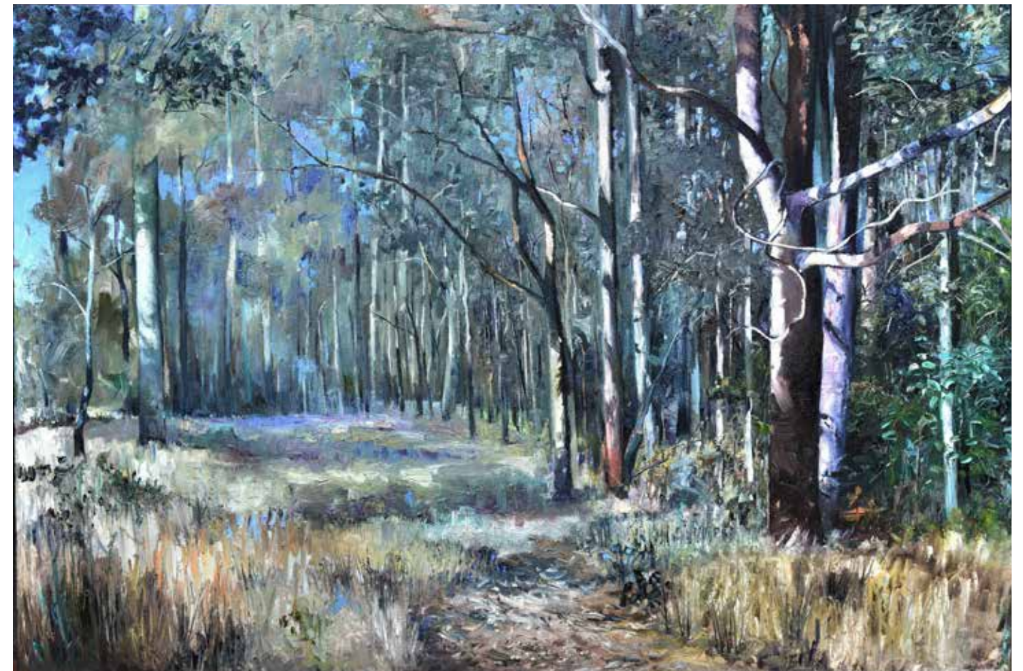
Mahogany Haze oil on canvas