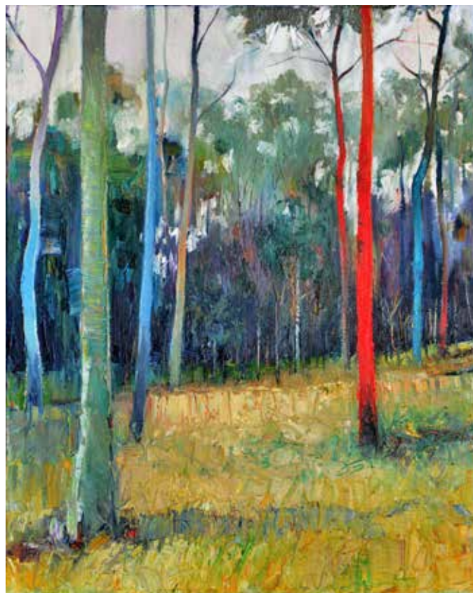
Bush Walk oil on canvas