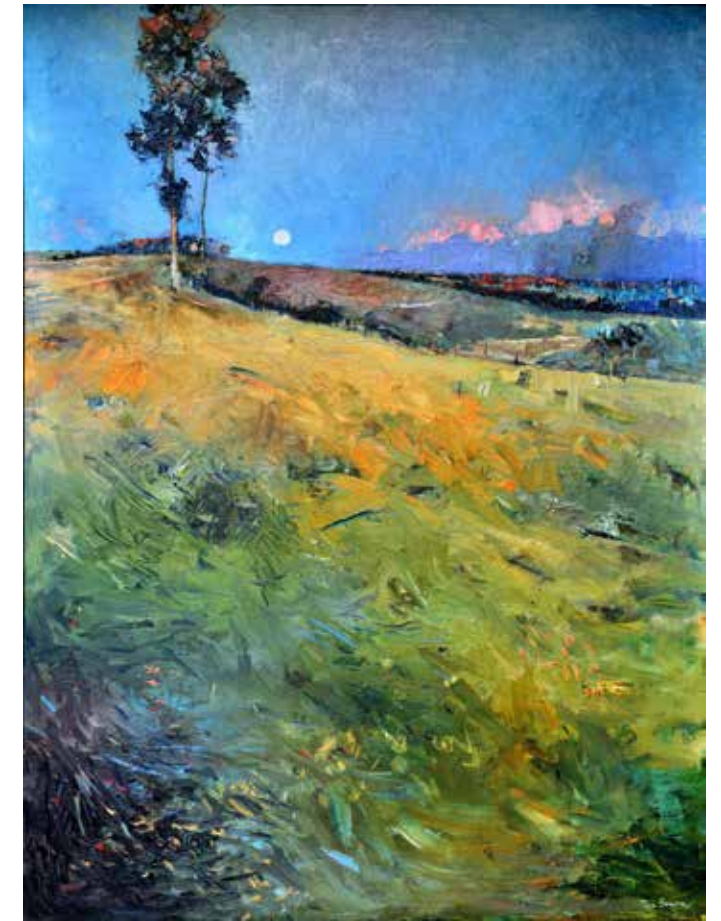
Bloodwood Ridge oil on canvas