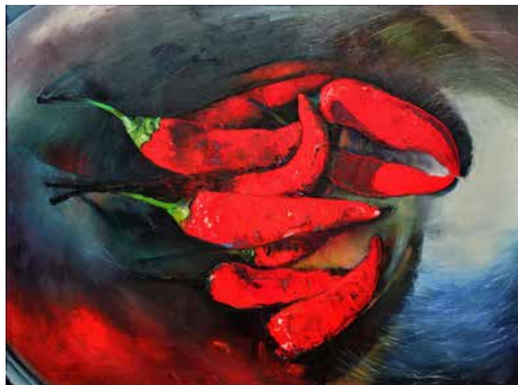
Seven Spanish Chillies in a bowl out in the sun oil on canvas