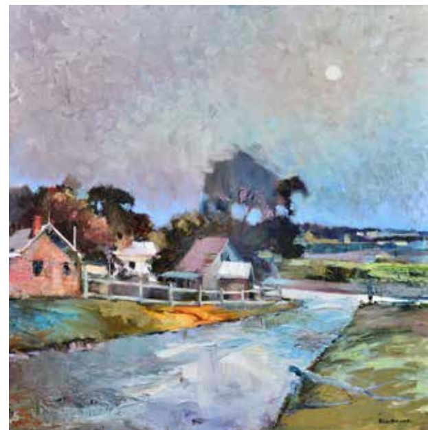
One night in a country town oil on canvas